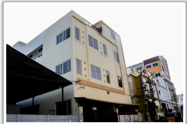
Head Office in Tirupur (India)

We have an optimally infrastructure replete with processing and packing units to produce high quality garments , state-of-art multi location units for various niche knit products.