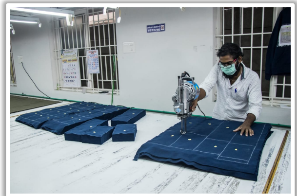
Cutting is done by experienced persons